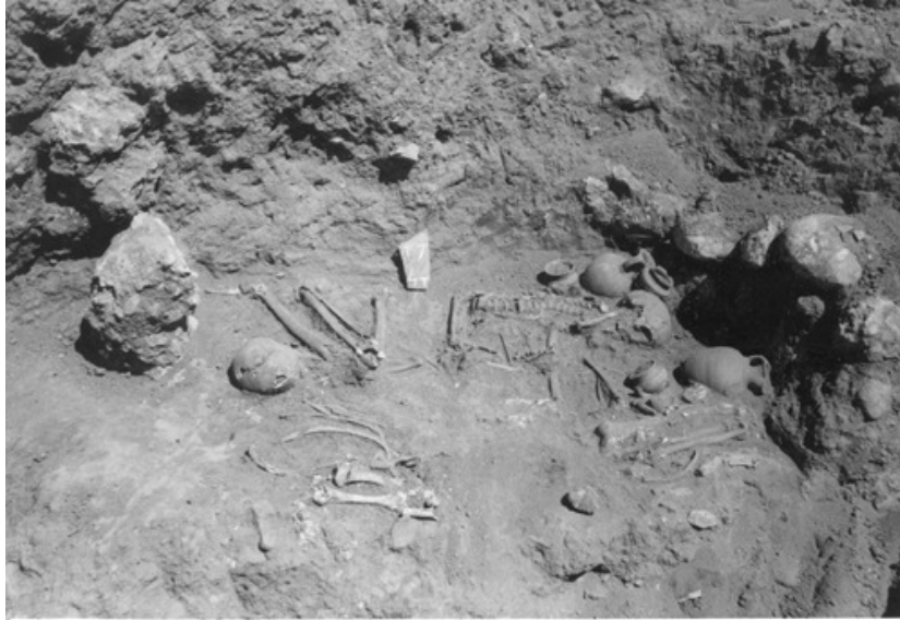
Tomb 4 in Tranchée 7 during the excavations