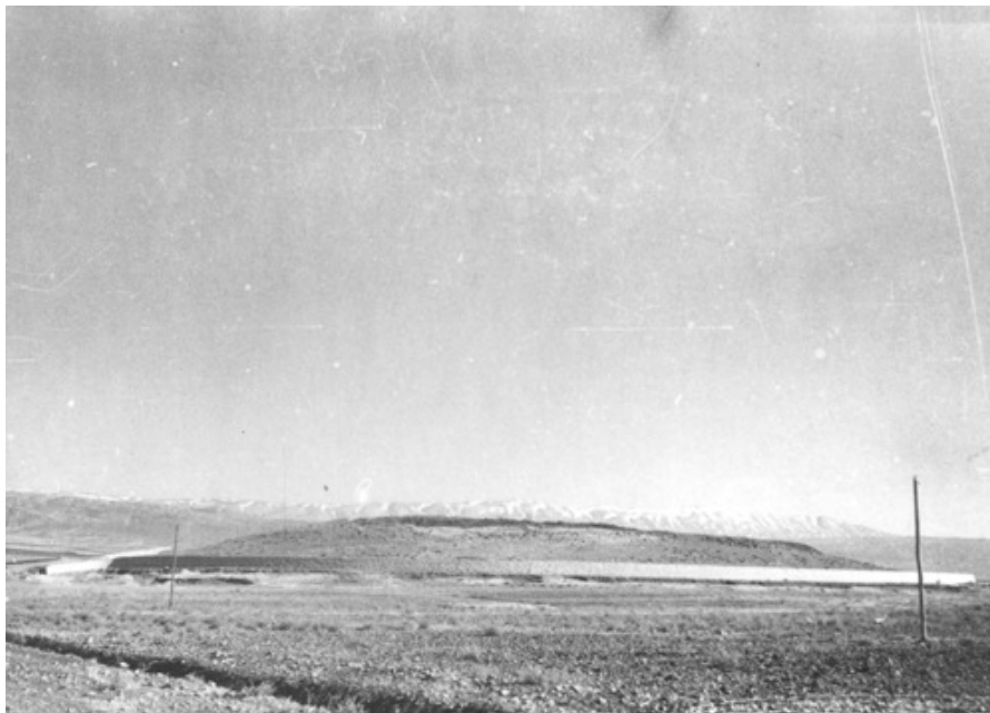
Tell Hizzin during the excavations in 1949-1950