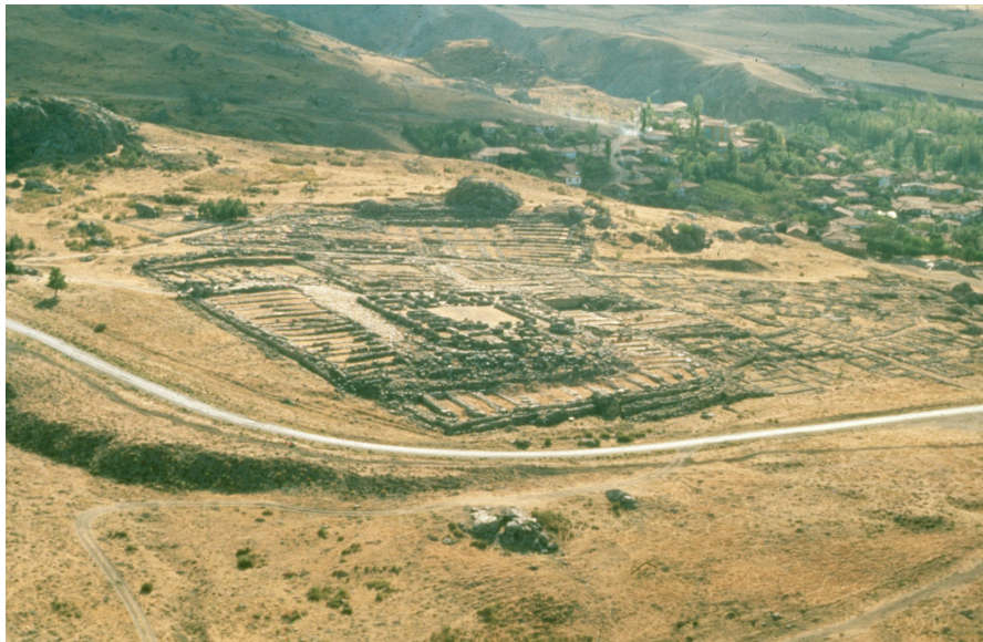
Boğazköy, view of the Lower City with Temple 1 from the east. The Iron Age cemetery is located above the ruins of Hittite domestic dwellings west of the temple.

The study will result in a monographic publication, describing the graves and their contents as well as placing them in the larger geographical and social context of Iron Age burial customs in Central Anatolia.