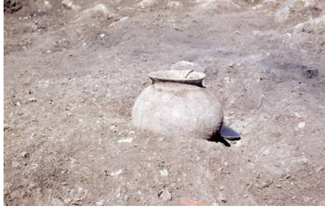
Burial 2/76 during excavation