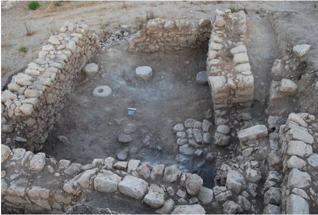
A well-preserved room from the Early Bronze Age II