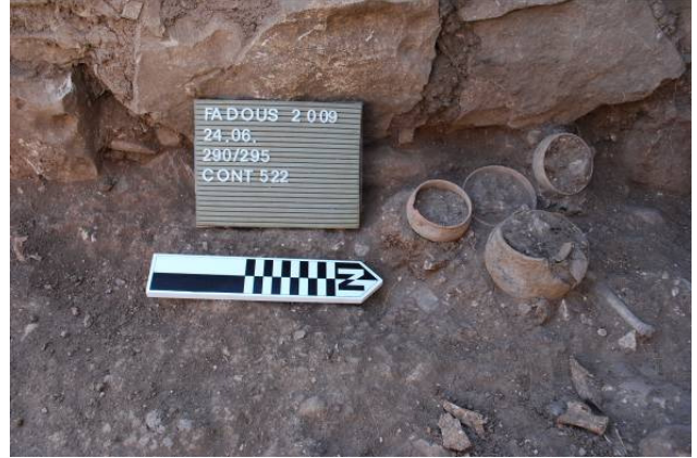
Early Bronze Age II vessels in situ in room 2 of Building 1