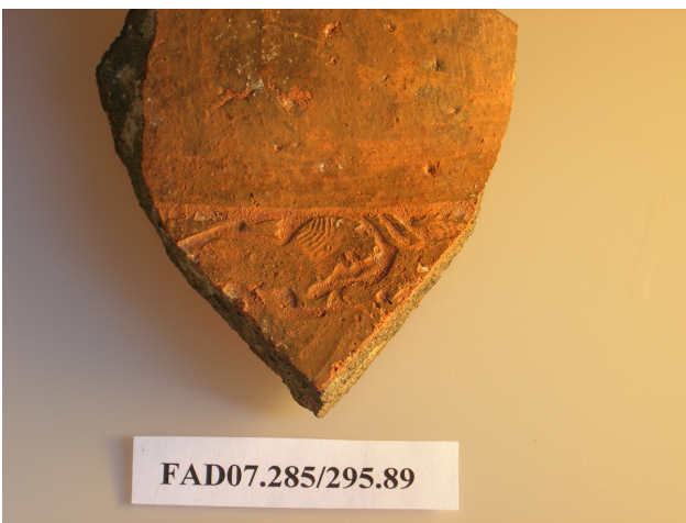
Early Bronze Age cylinder seal impression on a storage jar