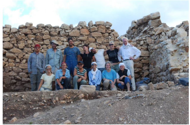
The excavation team of the 2009 season