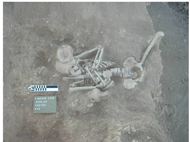
A Middle Bronze Age burial