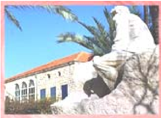
Statue of Abu Chabkeh Facing the Museum