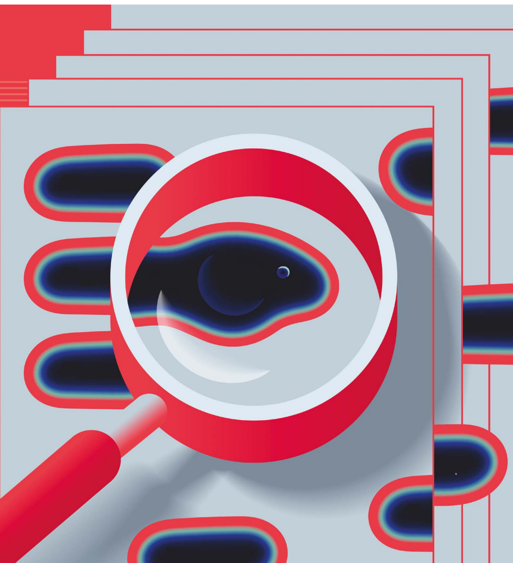
ILLUSTRATION BY ANA KOVA

blog run by science journalist Leonid Schneider, a list of more than 400 published papers they said probably came from a paper mill. Bik dubbed it the ‘tadpole’ paper mill, because of the shapes that appeared in the papers’ western blot analyses, a type of test used to detect proteins in biological samples. A spate of media headlines followed. Throughout the year, the sleuths (not always working together) posted spreadsheets of other suspect papers – picking up on similar features across multiple studies. By March 2021, they had collectively listed more than 1,300 articles, by Nature’s tally, as possibly coming from paper mills.