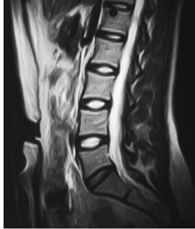
Fig. 1 Sagittal MRI T2 image of lumbar spine (Case 1) showing diminished signal intensity at L5-S1 disc

Three fluoroscopically-directed lumbar epidural steroid injections were performed at one-month intervals and she underwent physical therapy at the same time. Four months after the start of her initial pain, lumbar discography was performed at L5-S1 level; the L4-L5 disc was used as a control. On discography patient reported no pain on injection at L4-L5 level but complained of severe concordant pain when the L5-S1 disc was injected. Post-discography computed tomogram (CT) showed a partial annular tear (Grade 2-3, Dallas classification) 4 at L4-L5 level (Fig. 2), but at L5-S1 level there was a complete annular tear (Grade-4) with sub-ligamentous extravasation of dye (Fig. 3).