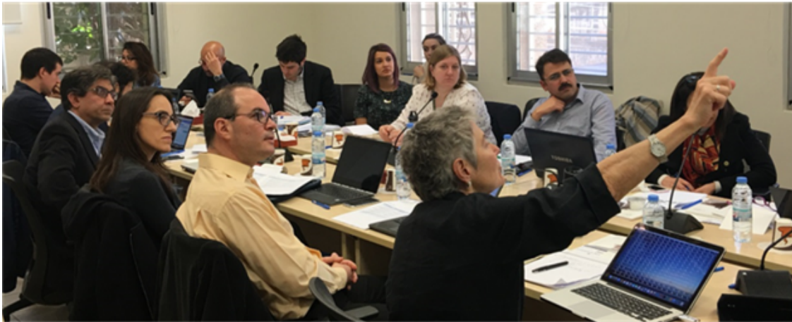
The Lancet-AUB Commission on Syria Electronic Newsletter - Issue 2 February - March 2017